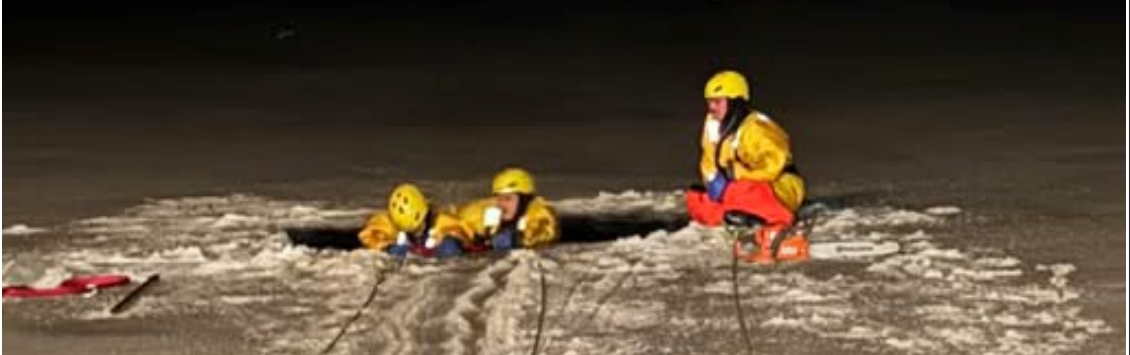
Courtesy photo shows the Georgetown Fire Company recently out on Mill Pond training for cold water rescue.