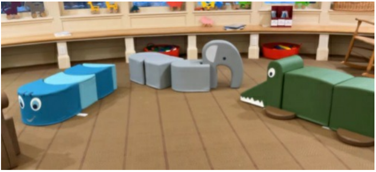
Courtesy image shows the fun new seating in the children's book room at the Mark Twain Library.