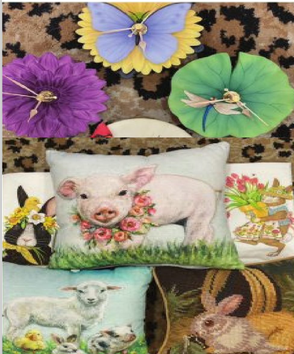
Patricia's Presents has gifts and accessories for your holiday gift giving. They are located at 164 Greenwood Avenue in Bethel.